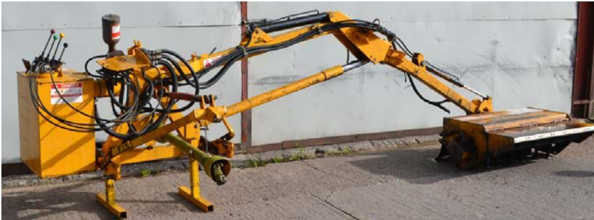
Lot 185 McConnell Power Arm (PA91T) Flail hedge cutter 1995 Cable controls