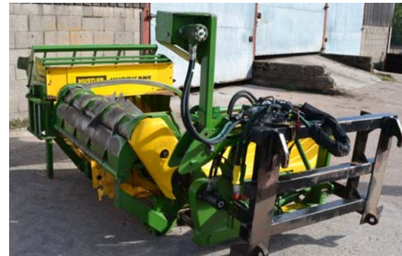
N.B Headstock to be sold separately Lot 210