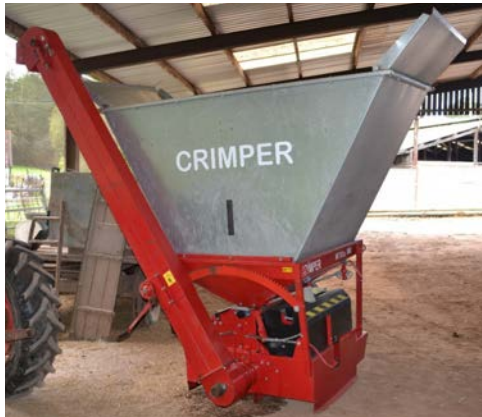
Lot 186 Vee-Lik M700A Grain crimper 2009 PTO driven