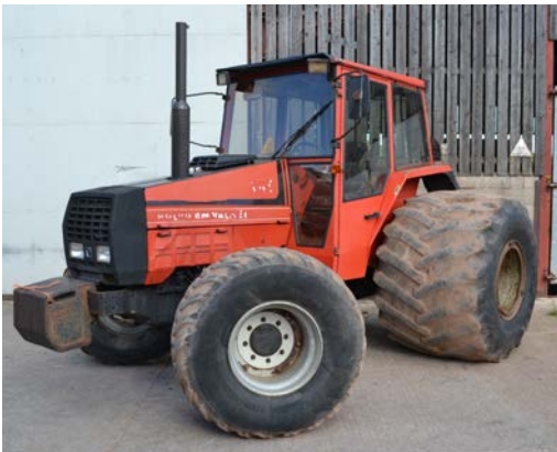
Tyres photographed above Lot 214

1984 Reg: B404 DEG 10,781 Hours 85 hp 4WD C/W 10x30kg front weights Tyres Front - 380/85 R38. Rear 13.6 R24 (not as photographed)